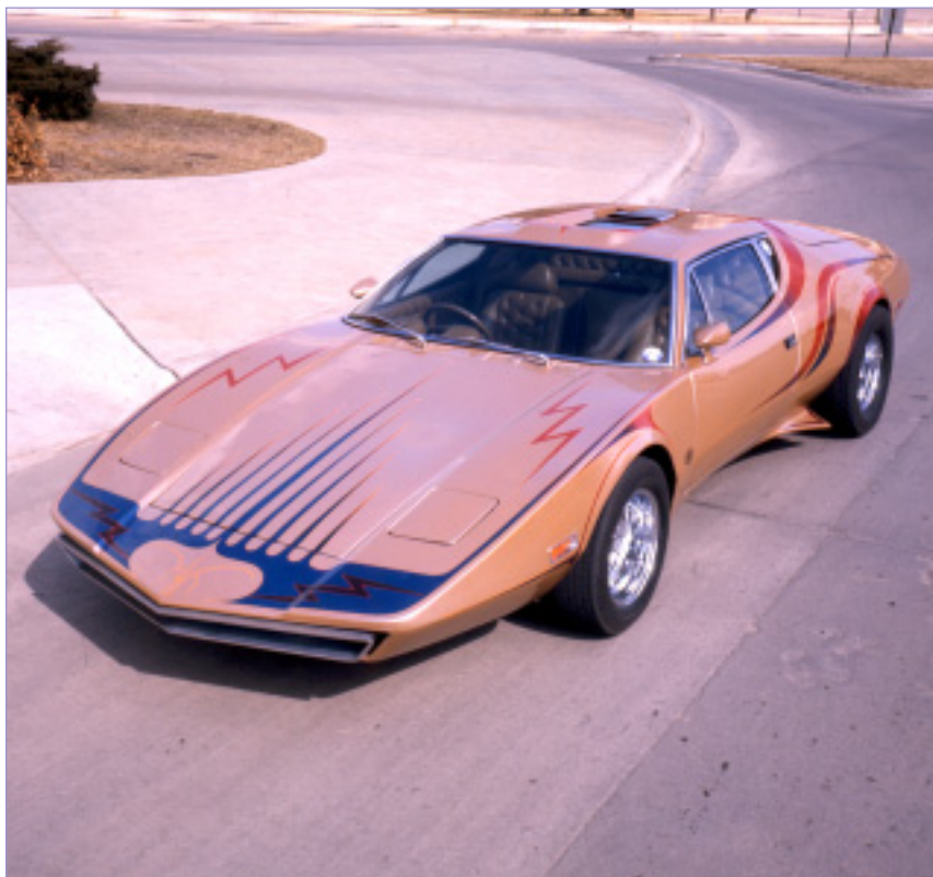
Above: In “Marvel” livery, the paint scheme was a blending of purple, blue and red.