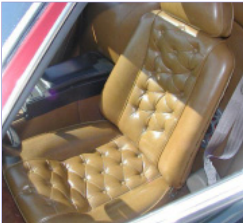
Below: Diamond button tuck Pantera seats.