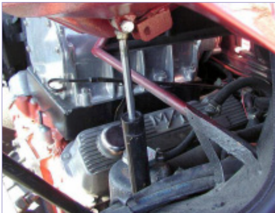
Above: Zoomy coachwork heavily disguises the original Tjaarda design. Wire wheels supplant the original Campy’s. Left: Faux GMC huffer still looks menacing. Below: Delta wing was added by a subsequent owner.