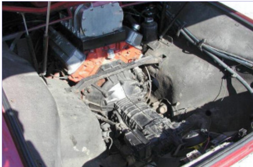
Above: The engine by history has been overhauled but the exact components used and specifications are unknown. Most probably the car will be displayed with the engine bay closed. Below: The door panel trim is also matching beige and diamond tufted.