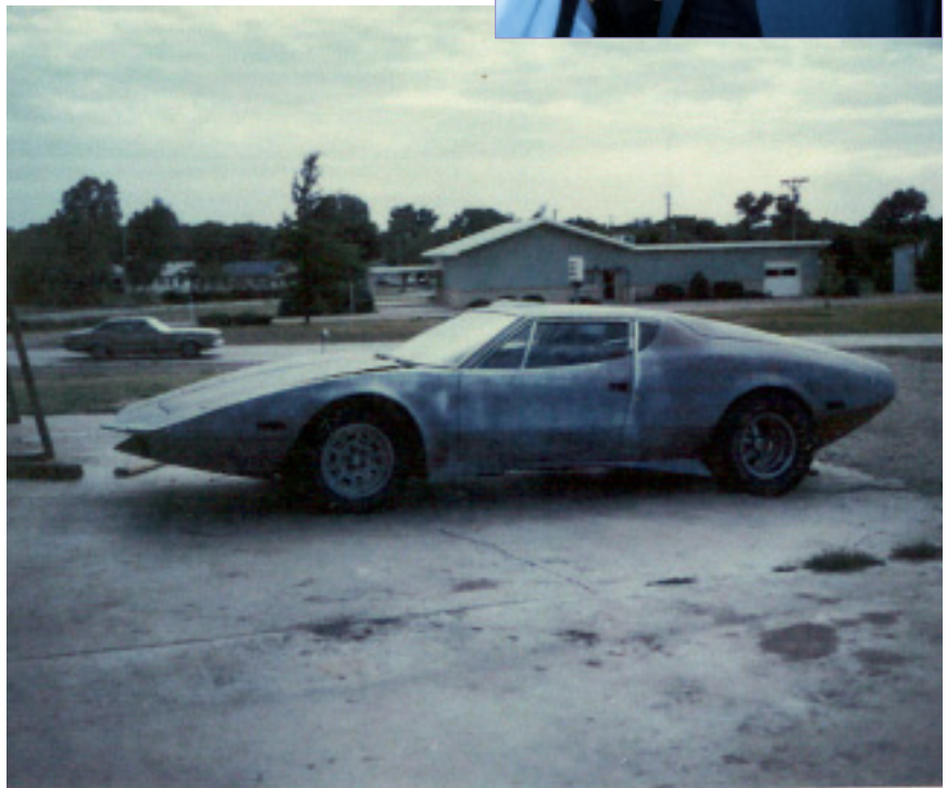
CONSTRUCTION - 1975